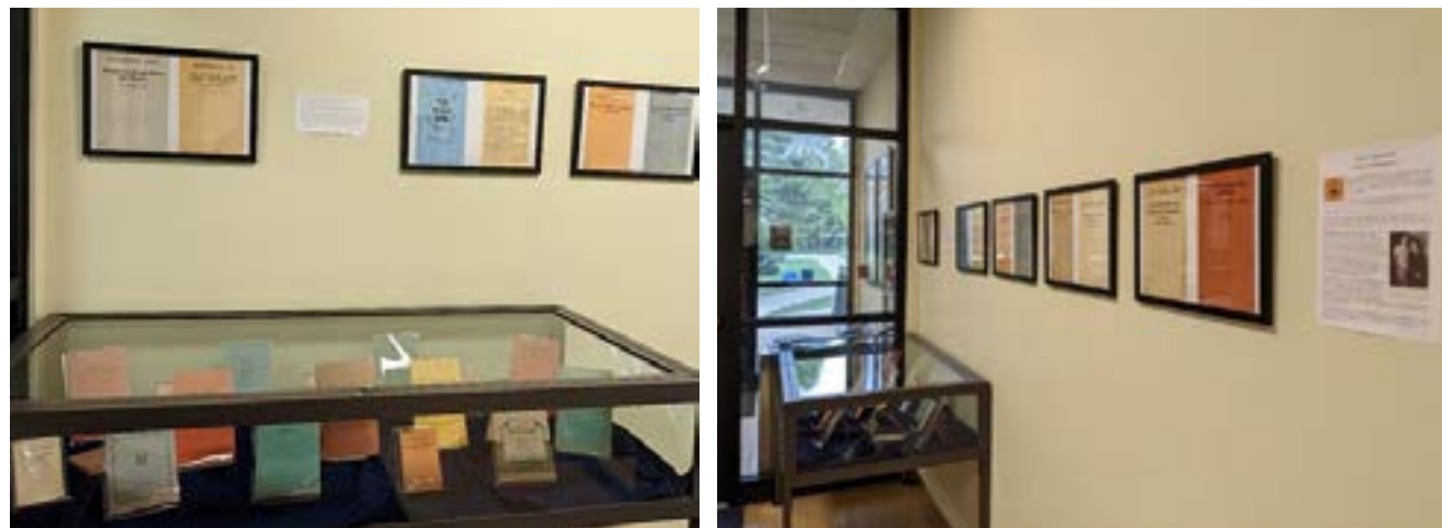
Photos of the Haldeman-Julius Blue Books Exhibit inside Washburn's Mabee Library.