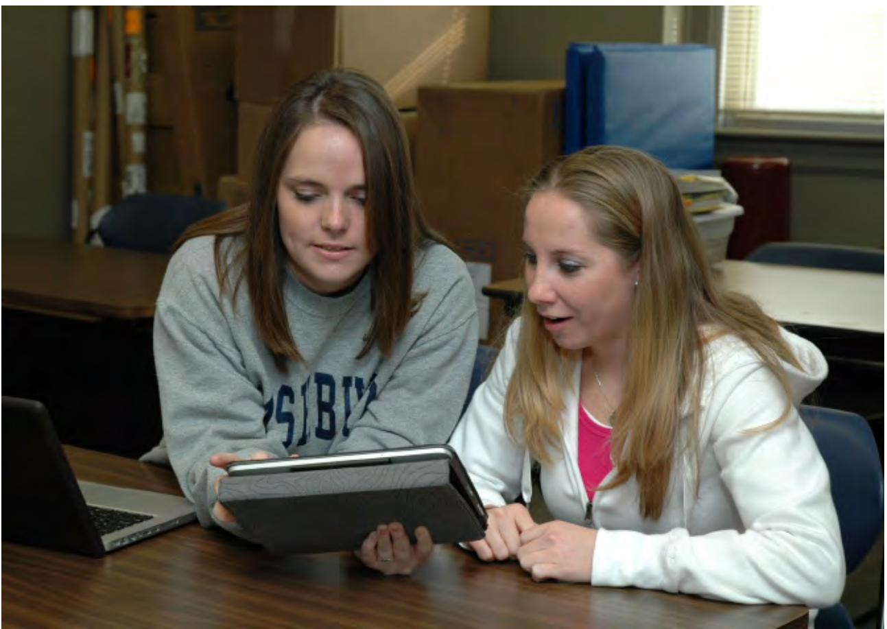
Students utilize technology to discuss a class project.

Information is available by contacting the Financial Aid Office in Morgan Hall 267 or by calling 785-670-1151 or (800) 524-8447. Admission to Washburn University is a prerequisite for consideration of financial assistance.