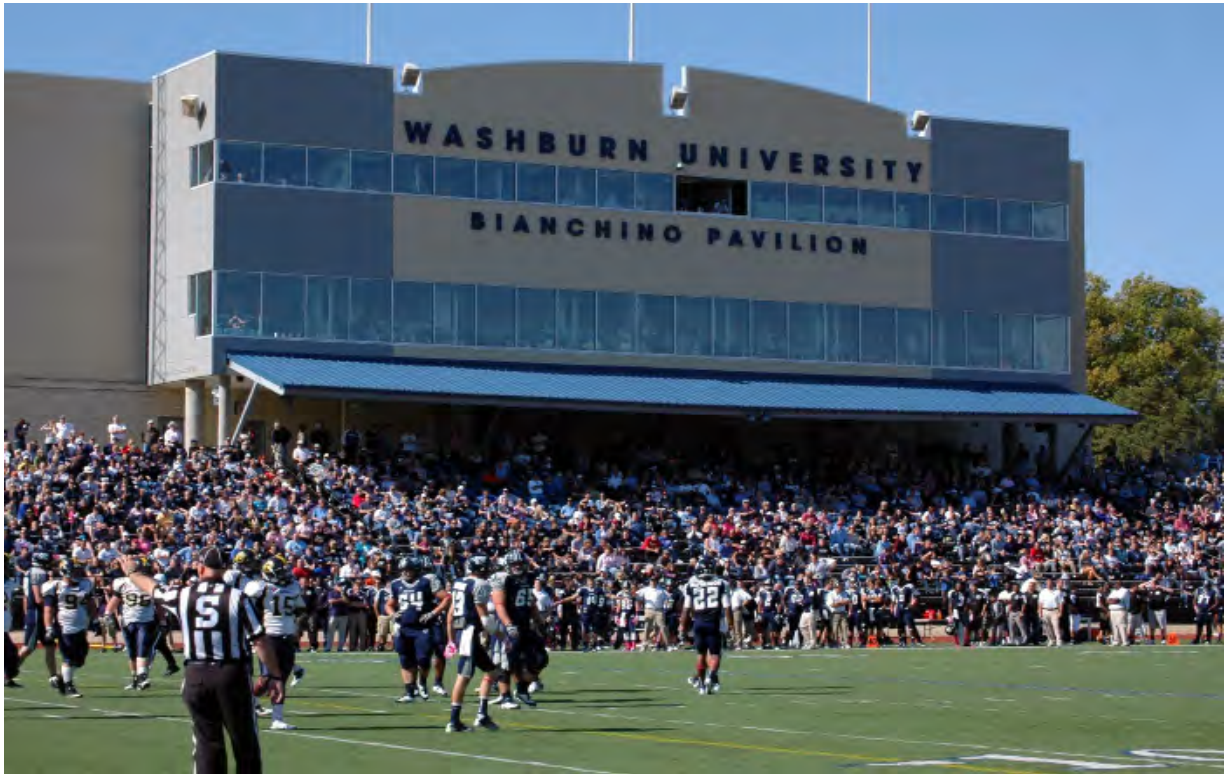
Fans enjoy cheering on the Ichabod football team.

The diverse summer program is planned for students who wish to begin their college study, for those who wish to continue their regular academic programs, for high school youth who wish to pursue special interests, and for adults who wish to pursue studies on a professional level or for individual self-improvement.