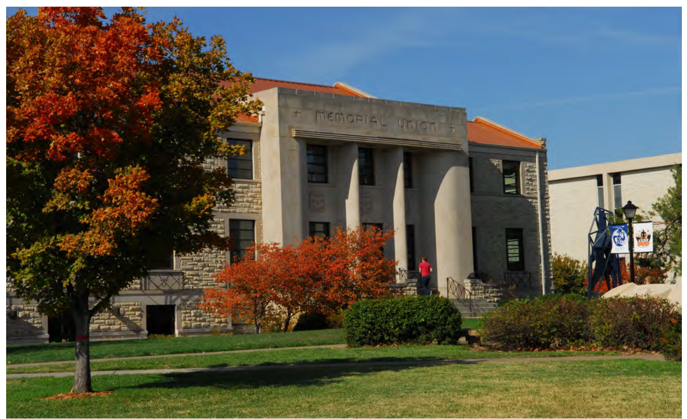
The Memorial Union, dedicated in 1952 as a memorial to Washburn students and Shawnee County residents who lost their lives in foreign wars, holds the Ichabod Service Center, Union market food court, the University Bookstore and Washburn Student Government Association.