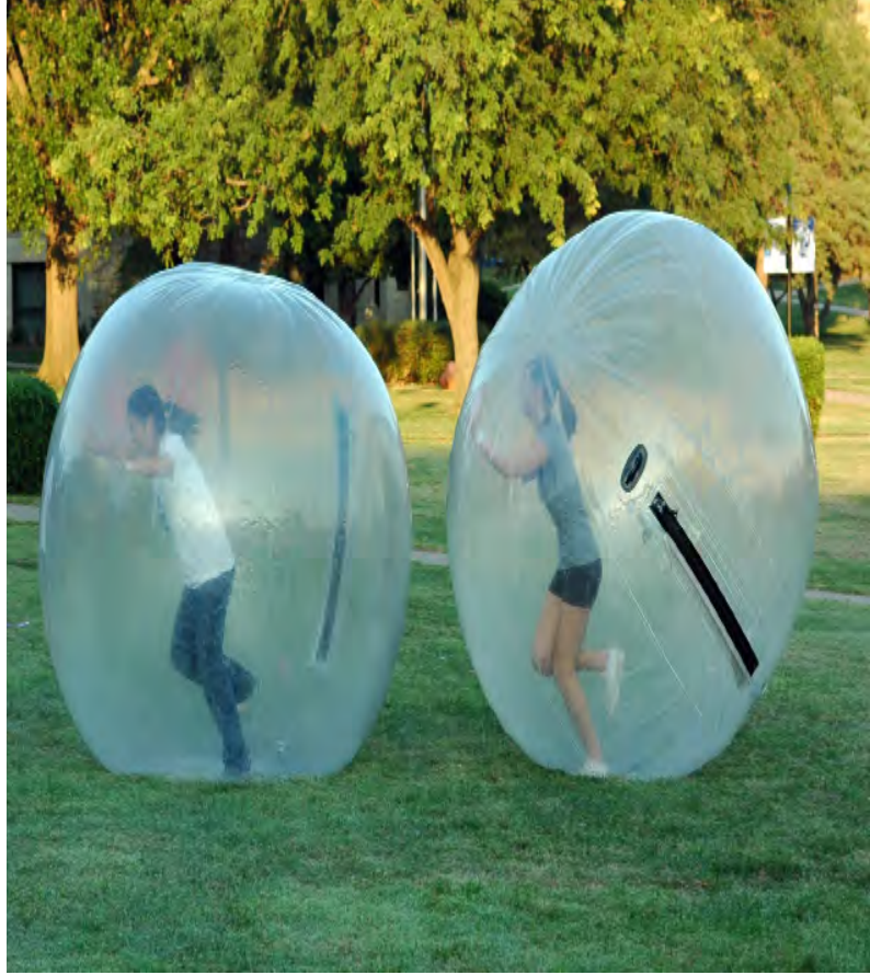
Students enjoying activities during Welcome Week.