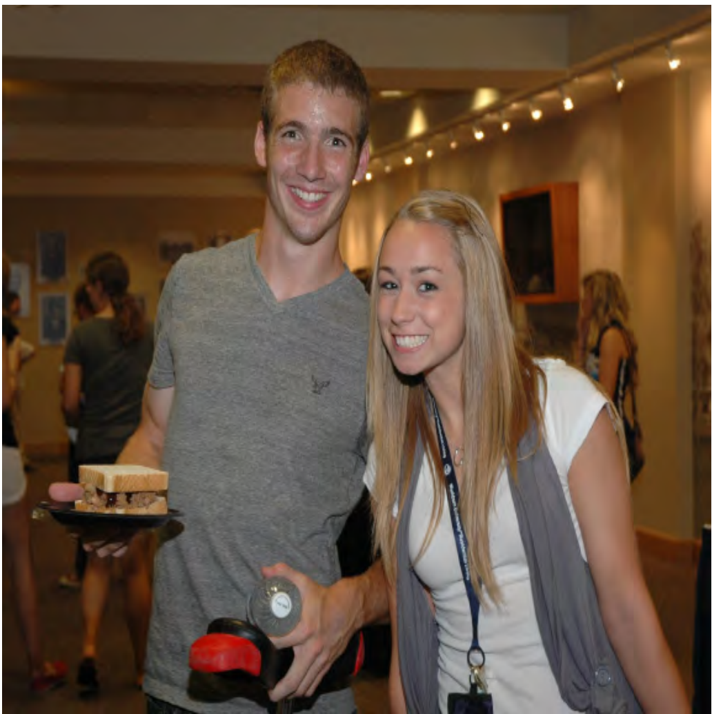
Students enjoying the activities at Convocation 2011.