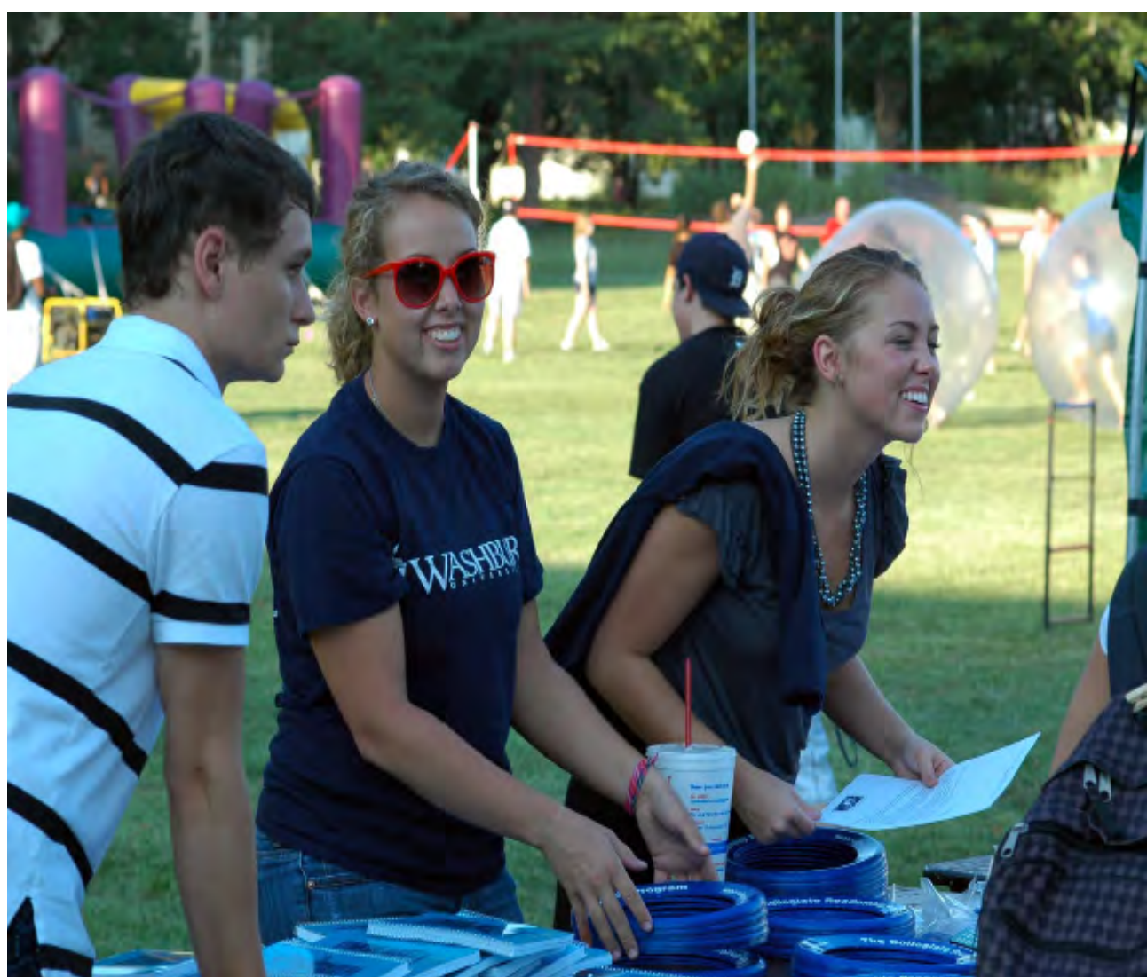
Activities and camaraderie add to the fun at WUFest which is part of Welcome Week.