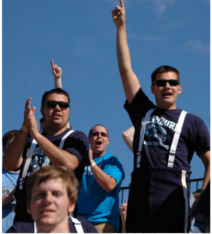
Band members display their Ichabod spirit while cheering on the football team.

Petitions are available through Academic Advising in Morgan Hall 122. For transfer students or former Washburn students who have subsequently attended another institution, an official copy of all transcripts must be on file in the Office of Admissions before the application is considered. Students must apply 30 days before each semester's enrollment period.