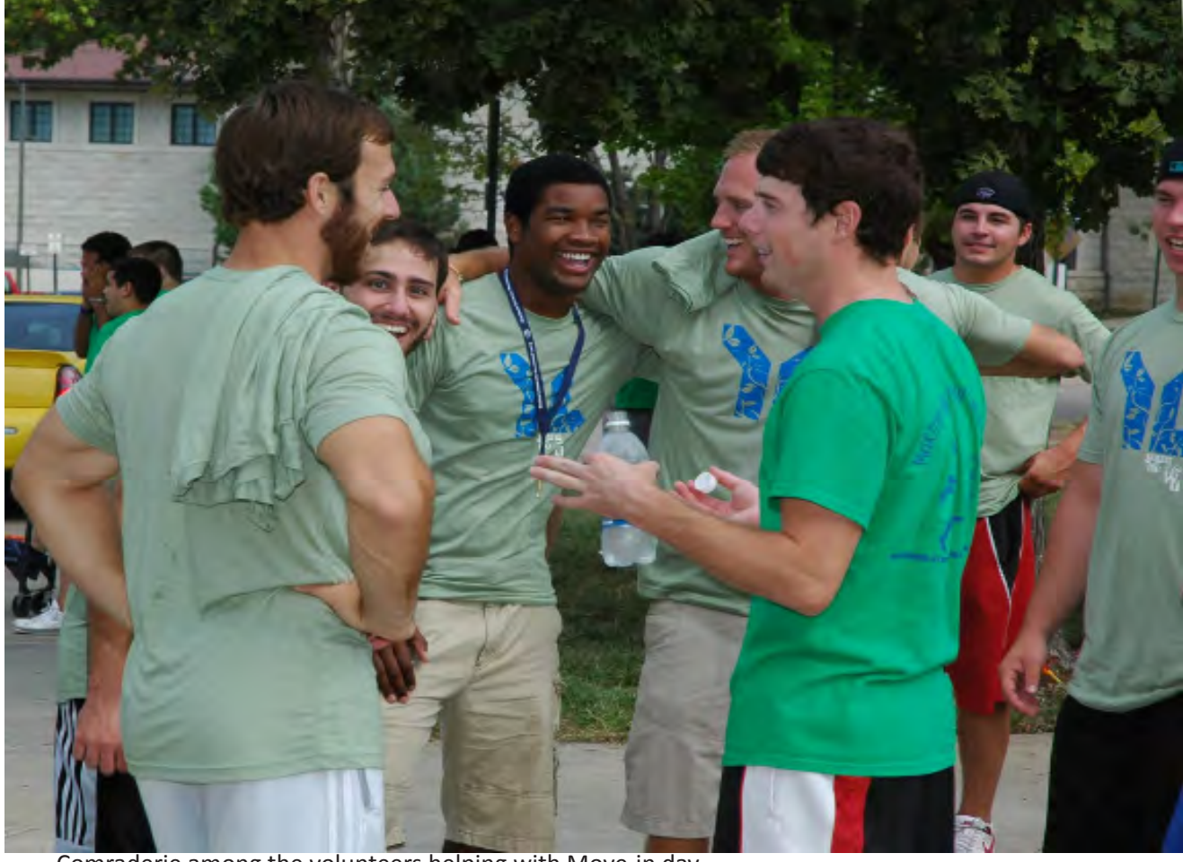
Comraderie among the volunteers helping with Move-in day.

the University campus. Several apartment complexes are within easy walking distance of campus, and Topeka offers a large selection with easy access to campus. Rental costs of approximately $450/month and up should be anticipated. These costs are often shared by two to four students thus reducing the per student cost. For more information, contact the Residential Living Office, Washburn University, 1801 SW Jewell Ave., Topeka, KS 66621.