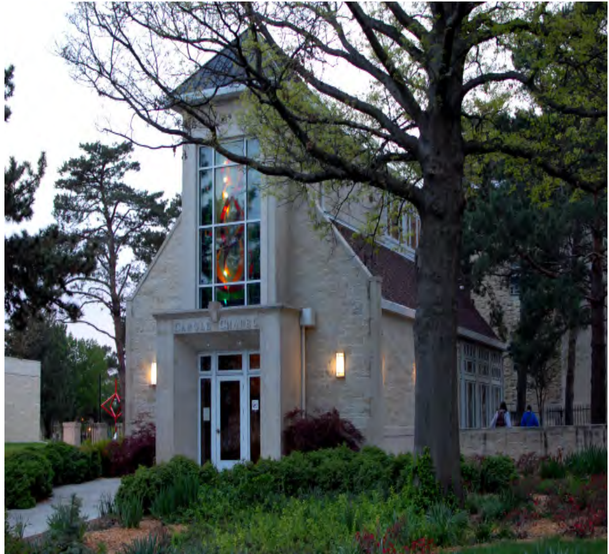
The Carole Chapel sits in the center of the campus.