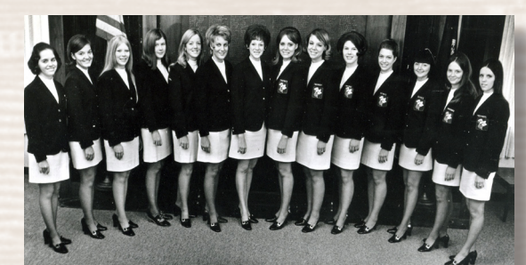
The Washburn Belles

Nov. 6, 1990: Alumna Joan Finney becomes the first woman and the first Washburn graduate to be elected governor of Kansas.